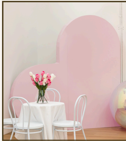
Giant hearts $99.00 each