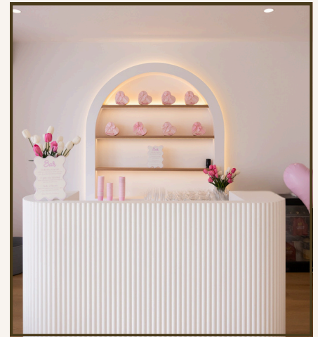
4h: 2 bar staff + bar $799.00