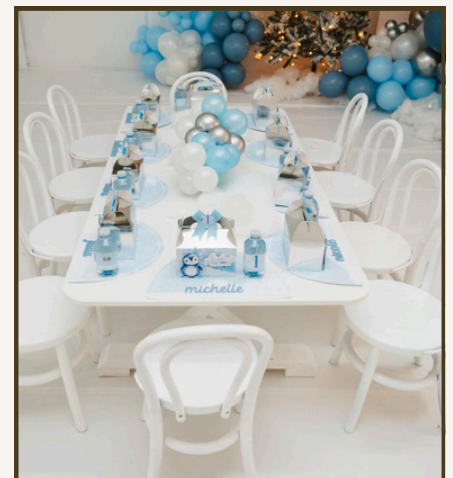
Kids Tables & Chairs TBC

Don't forget we also stock soft play packages & jumping castles!