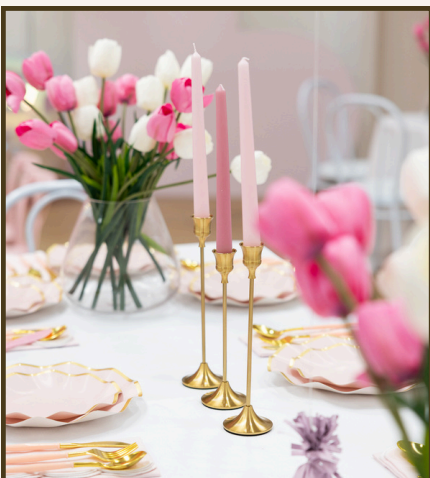
Table Styling $199.00