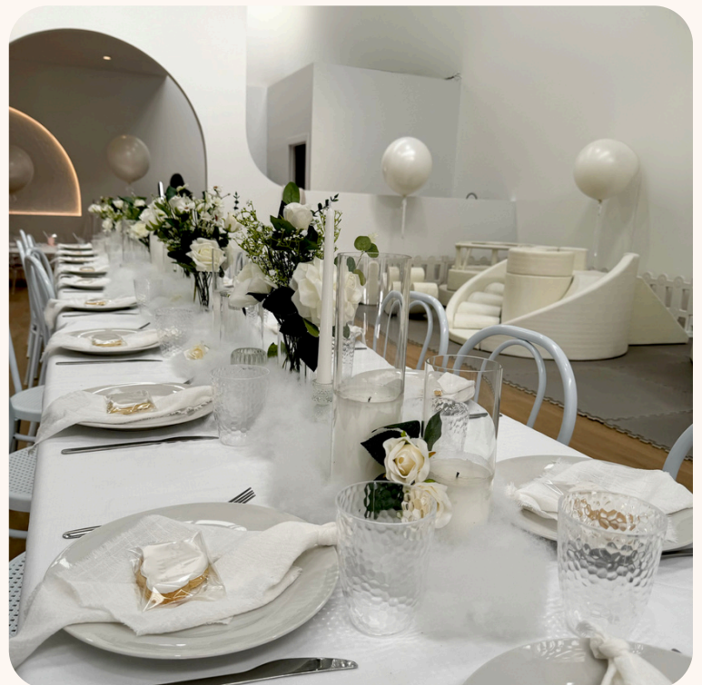
Table styling (table linen & setup/pack down incl)