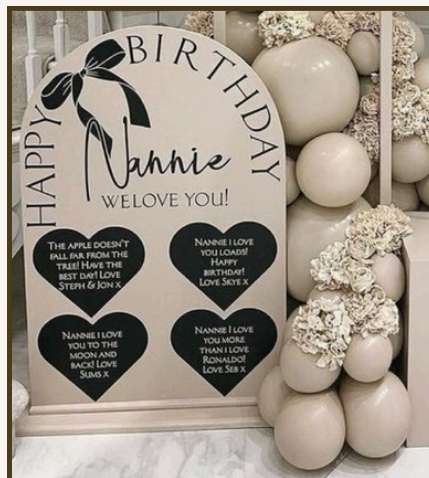
Custom A1 sign $95.00